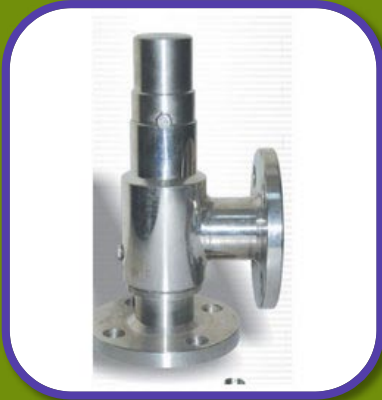
IBR Approved Safety Valve