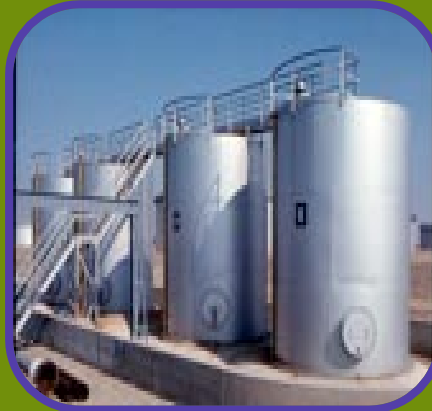
Calibration of Tanks