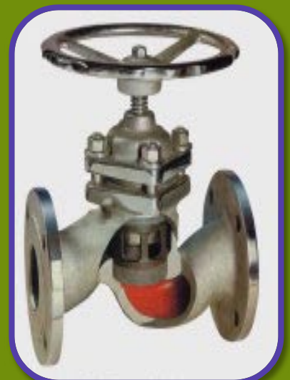
IBR Approved Piston Valve