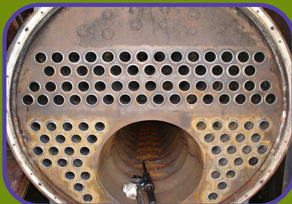
Re-tubing of Boiler