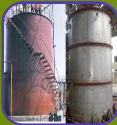
Water Feed Tank/ Oil Tank Fabrication