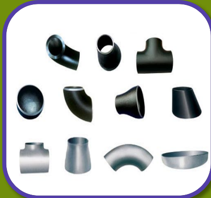
IBR Approved Pipe Fittings