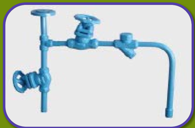
IBR Approved Trap