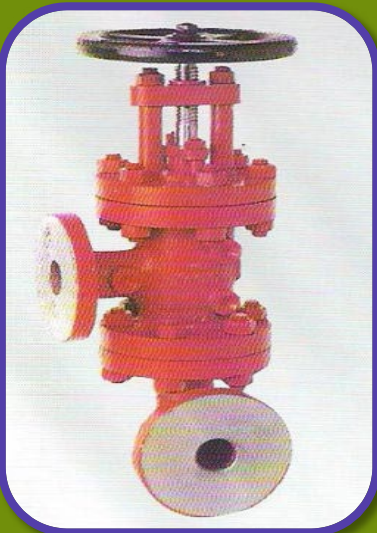
IBR Approved Feed Check Valve