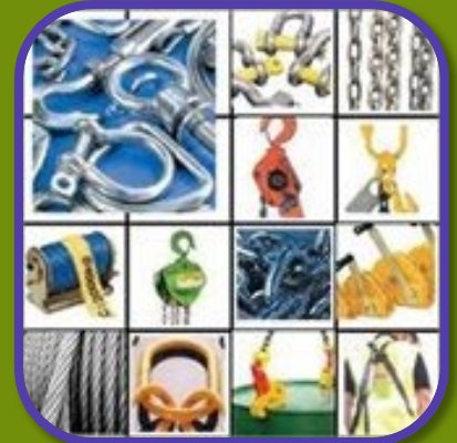
Testing & certifying of Lifting Devices