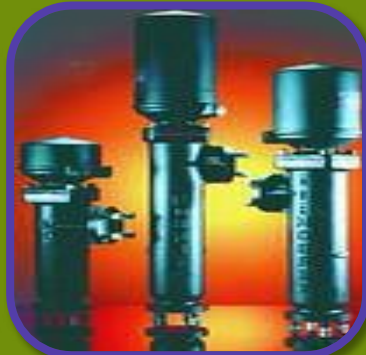
IBR Approved C. S. Mobrey